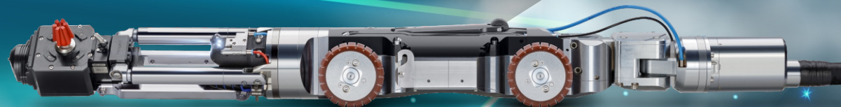
MicroGator ® 2.0

The IBAK MicroGator ® 2.0 is the impressive reinstatement cutter that is resetting the industry's expectations. It is equipped with a powerful, yet efficient electric motor that outperforms existing pneumatic and hydraulic grinding/cutting robots. It has a maximum revolution speed of 10,000 RPM while running at 3.5kW. The BG 1 Motor allows users to install a front-viewing camera that provides a better view to increase forward awareness. The IBAK CutterCam, found directly behind the cutting motor, gives you an incredible view of the work area and keeps the lens clean with our unique air-curtain technology. Having these two views paired with our fourth-axis articulation provides operators with ultimate control. With cable lengths extending up to 500 ft (150m), interchangeable cutting/grinding bits, and the ability to access lines from 8" (200mm) all the way up to 32" (800mm), the MicroGator ® 2.0 is designed to withstand the toughest jobs.